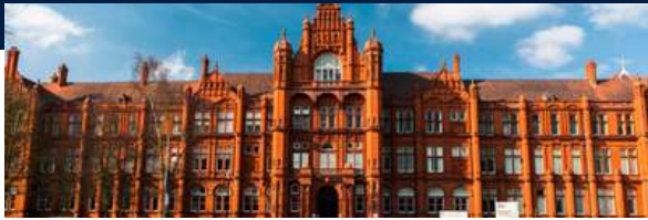
University of Salford, UK