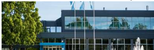
Turiba University, Latvia