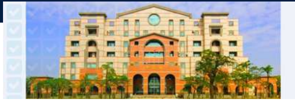
CTBC Business School, Taiwan