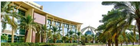
COPPEAD University, Brazil