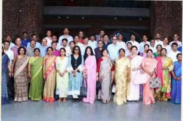
MALAVIYA MISSION TEACHER TRAINING PROGRAMME