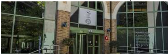
Alba Graduate Business School, Greece