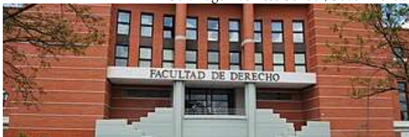
University of Lima, Peru