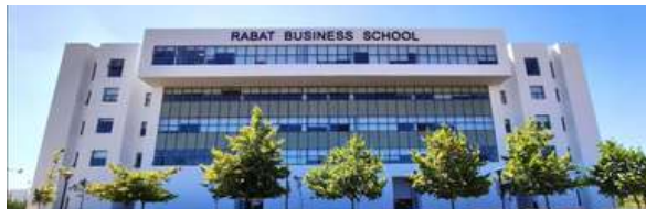
Rabat Business School, Morocco