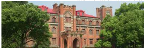
Soochow University, Taiwan