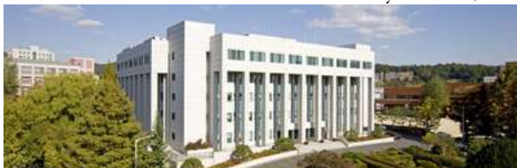
Solbridge Business School, South Korea