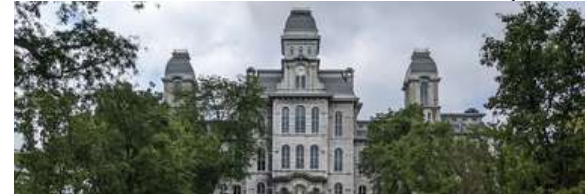
Syracuse University, USA