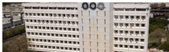
Coller School of Management Tel Aviv University, Israel