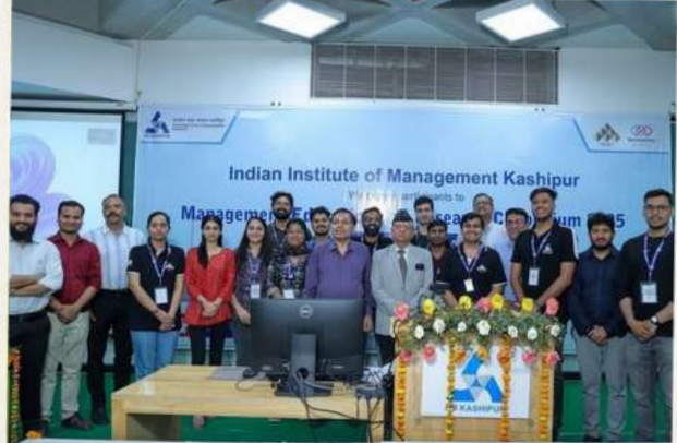
MANAGEMENT EDUCATION AND RESEARCH COLLOQUIUM